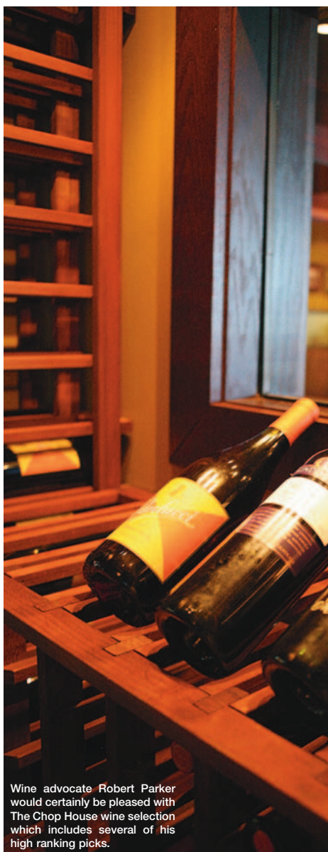
Wine advocate Robert Parker would certainly be pleased with The Chop House wine selection which includes several of his high ranking picks.

The restaurant industry in Murfreesboro certainly made a giant leap ahead with the addition of The Chop House. For whatever dining occasion you have, this cozy local eatery will draw you back time and again.