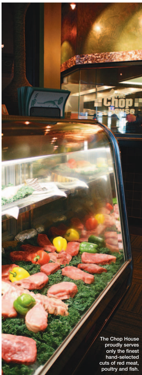
The Chop House proudly serves only the finest hand-selected cuts of red meat, poultry and fish.

The Chop House menu offers a variety of choices beginning with a vast selection of appetizers. My personal favorites are the signature Colossal Homemade Onion Rings and the Char Grilled Shrimp & Crab Cakes. Kendall Jackson Chardonnay pairs perfectly